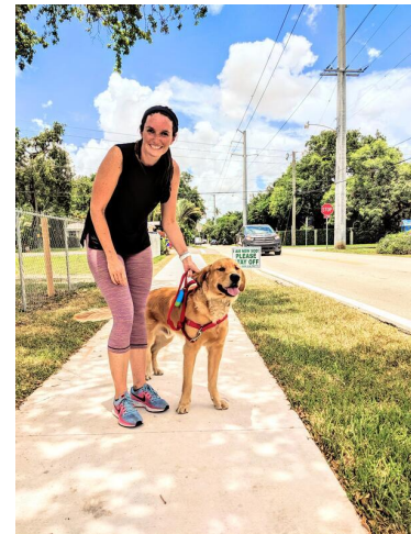
Sidewalk on SW 9th Avenue:

As many of you may have noticed, the sidewalk on SW