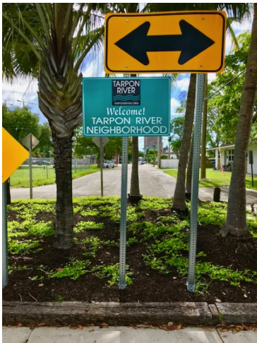
Tarpon River entrance on SW 6th Street:

TRCA Board members have worked with Parks &