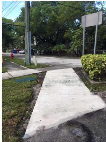
Sidewalk connection SW 5th Avenue & SW 5th Street:

TRCA Board members have worked with Parks &